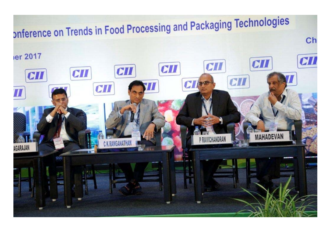
Day 1: 7 Sep 2017: Conference on Food Processing Technologies

ColdStoRe India along with the exhibition organized 3 days Sectorial conferences on Food Processing and Packaging Technologies, Cold Chain Technologies and Traditional Foods. Present at the conference were more than 250 senior personnel representing CEO's, Industry leaders and many leading manufacturers, dealers, suppliers, government officials and many more.