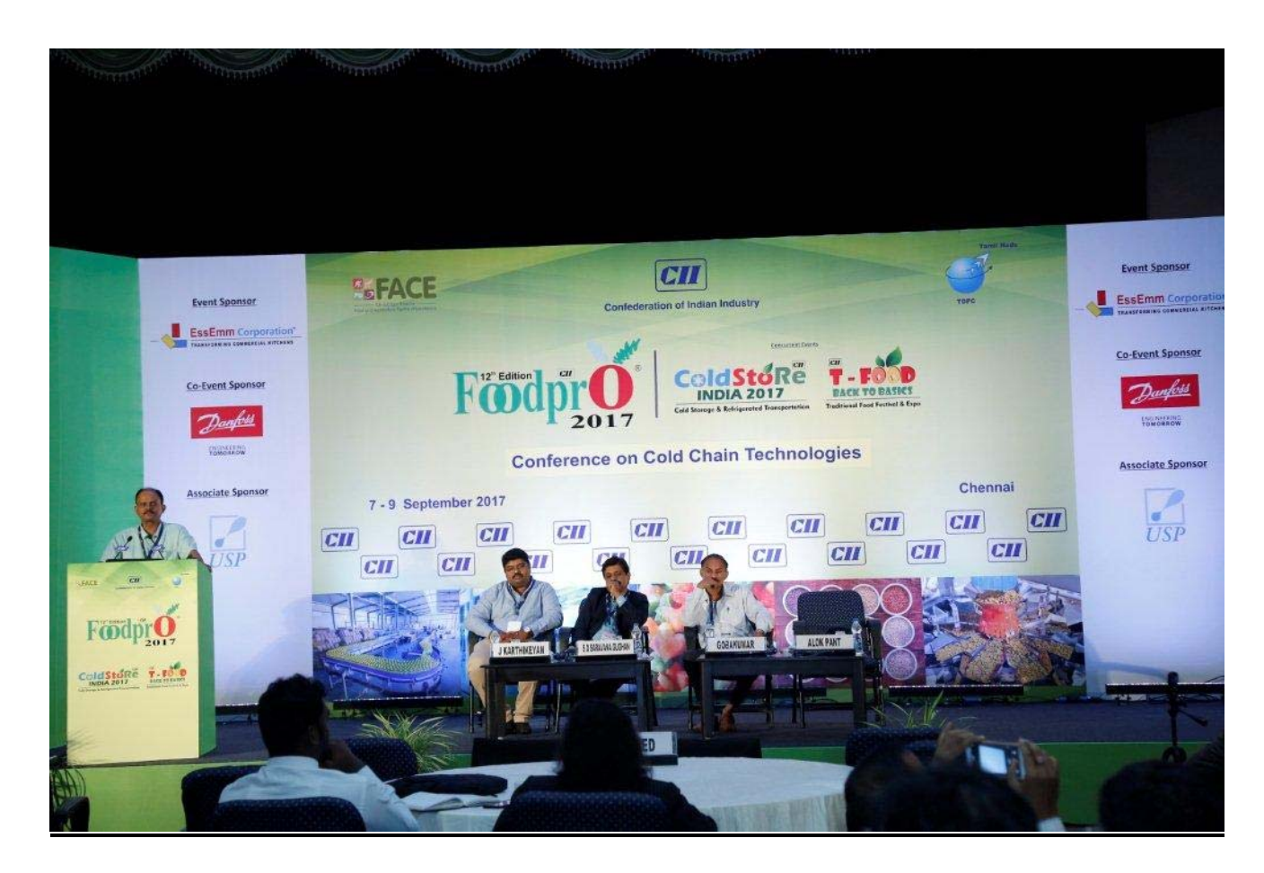
Day 2: 8 Sep 2017: Conference on Cold Chain Technology