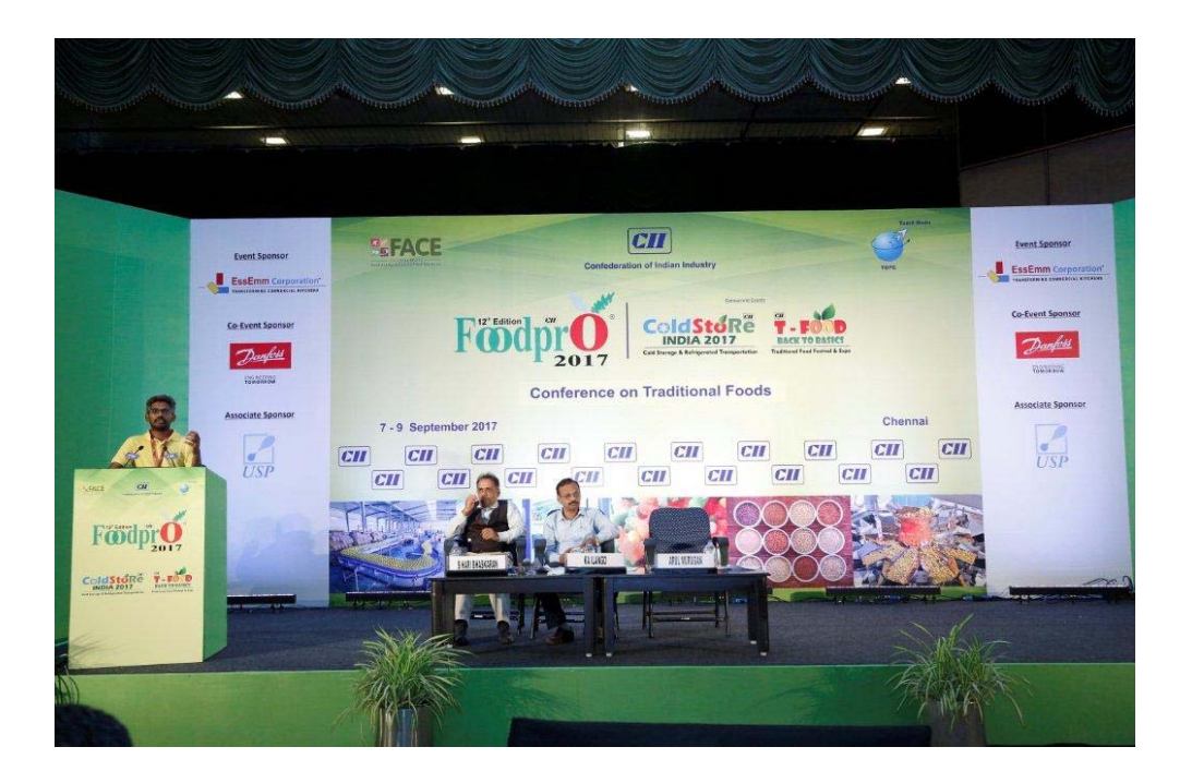
Day 3: 9 Sep 2017 Conference on Traditional Foods